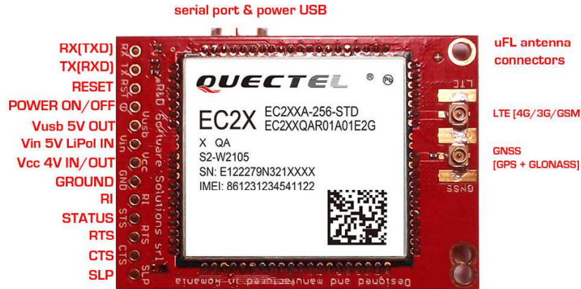
4G [LTE] SHIELD I-LTE v 1.07 top PCB view